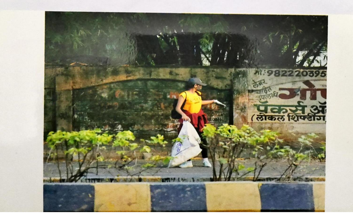
No plastics Day and Swatcha Bharat Abhiyan