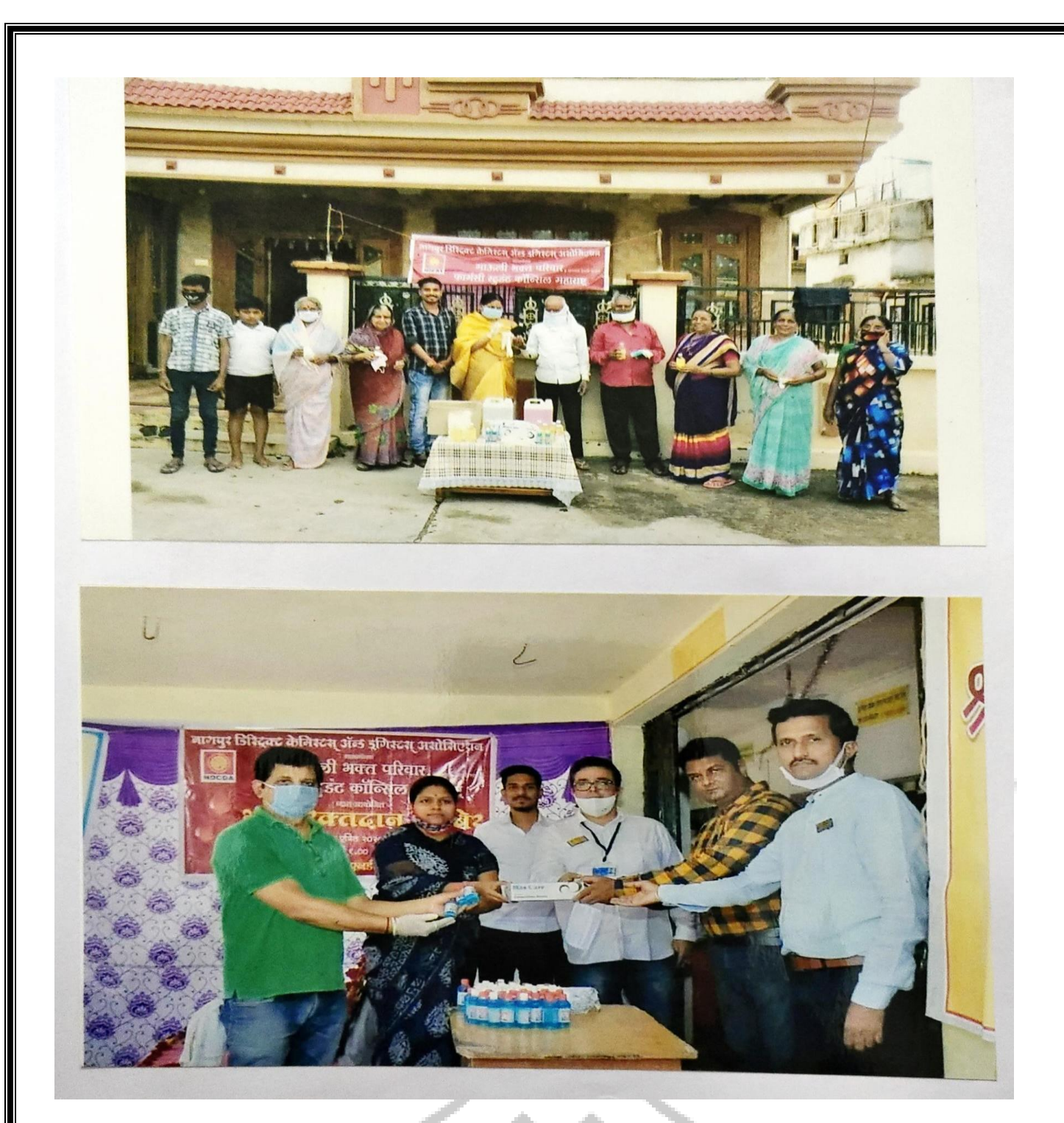
Mask and sanitizer Distribution 28/08/2020 and 29/08/20